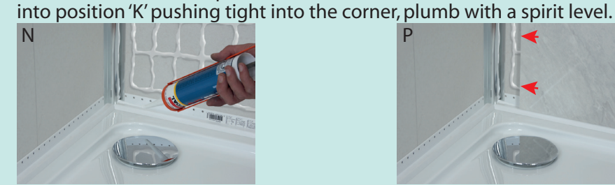
11. Apply a thin bead of waterproof sealant along the top of the Cladseal.'N'